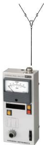
V type doublet