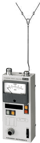
V type doublet